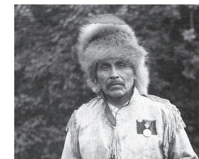
Capilano University was named after Chief Joe Capilano of the Squamish Nation.

In 1906, Chief Capilano led a delegation of B.C. chiefs to England and met with King Edward VII. While there, he was introduced to Canadian poet Pauline Johnson. They became good friends and after she moved to B.C.'s West Coast, Chief Capilano shared his legends, which she later recounted in her books and poetry.