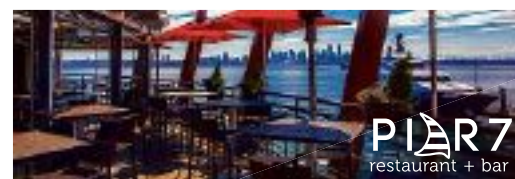
PIER 7 restaurant + bar

Daily Specials & Prime Rib Sundays New Summer Menu with Signature Dishes Private Dining Room for up to 40 Guests International & Local Wine List LobbyRestaurant.ca | 604.973.8000 138 Victory Ship Way, North Vancouver