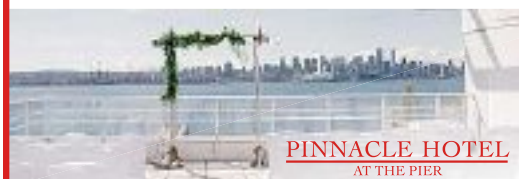
PINNACLE HOTEL AT THE PIER

FROM $299 FOR WEEKENDS IN JUNE & JULY BOOK NOW • PINNACLEHOTELS.CA